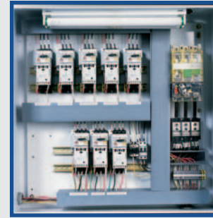
All Belanger components are built to withstand rigorous use day in and day out. Optional 50hp AirCannon shown.