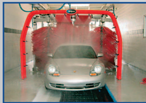
Bright colors and soft lines offer an inviting look and help optimize the customer experience.

Bright colors and soft lines offer an inviting environment that attracts attention and enhances the customer experience. The Enduro Class 60™ is packaged as an attended system. A self-loading option is also available.